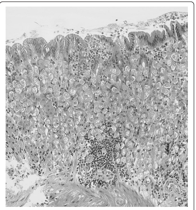
Figure 2 Inflammation in the gastric lamina propria of a Helicobacter -infected Dunnart. An image is shown from an H&E stained section of gastric corpus, from a Helicobacter -infected Dunnart (magnification ×100). The stomach was collected in May 2004.

In several cases in 2003 and 2004, females that were deemed to be pregnant from reproductive monitoring had aborted the litter when they were examined to obtain embryos.